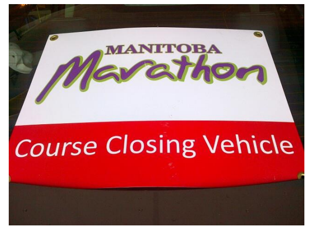
Existing Course Closing Vehicle Sign (not magnetic)

Unavailability of magnetic Course Closing vehicle signs first reported in 2014, to date replacement signs have not appeared. There seems to be only one sign, it is a flexible flag more suited for hanging at a fixed site.