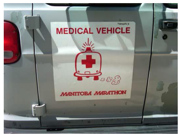
Marathon Medical Vehicle Sign, 2011 photo

Unavailability of magnetic Course Closing vehicle signs first reported in 2014, to date replacement signs have not appeared. There seems to be only one sign, it is a flexible flag more suited for hanging at a fixed site.