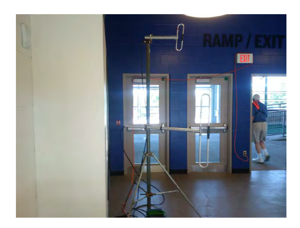
Cross-Band Repeater Antenna Location

Very specific information is required in Comm Centre if operators radio in a request for emergency medical assistance. Required information is in ARES booklet (page 11) and was briefed at ARES volunteer briefing but if