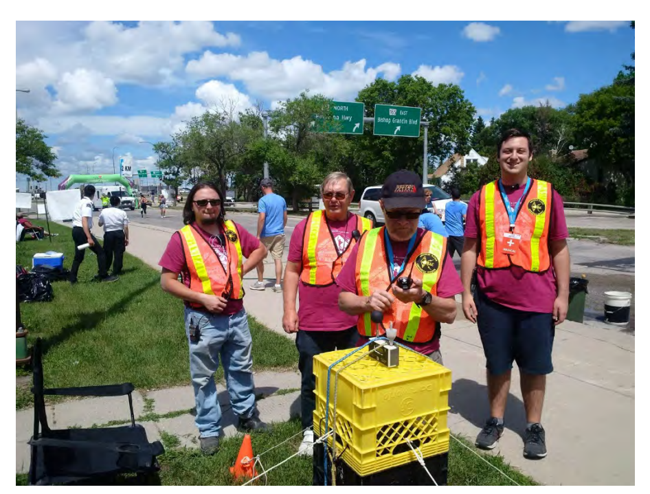
Mile 25 Hospitality Net and Wet Bulb Operators VA4CQD, VE4NQ, VE4STS, NJR